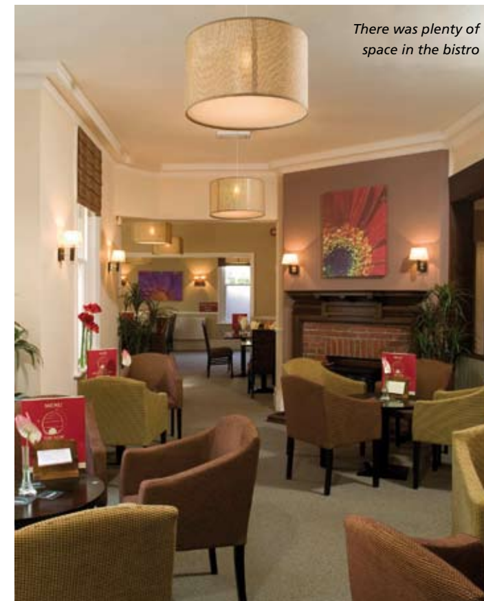
There was plenty of space in the bistro