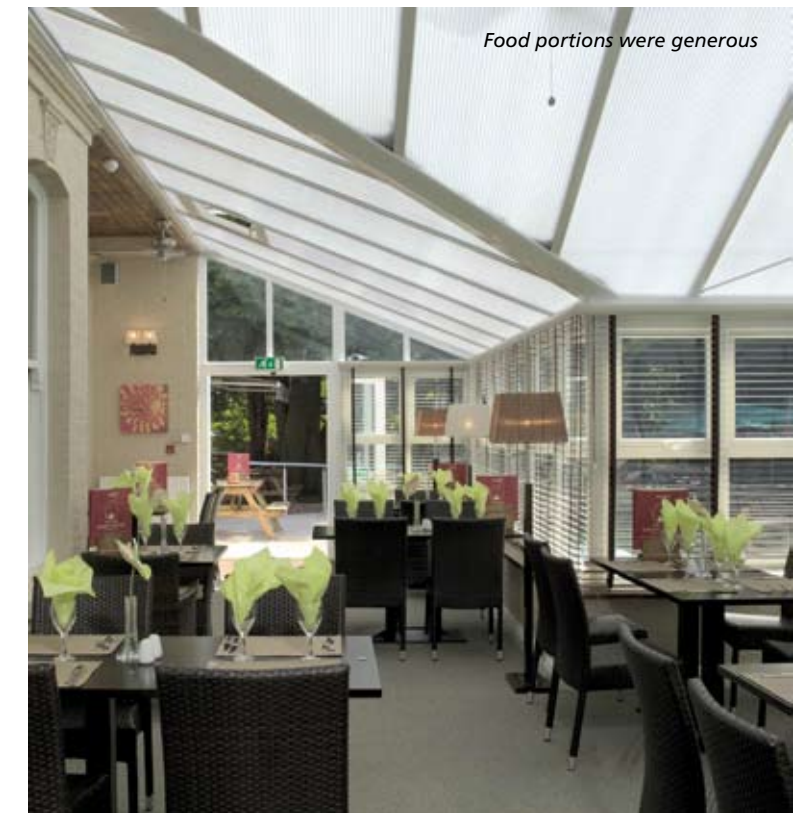
Food portions were generous