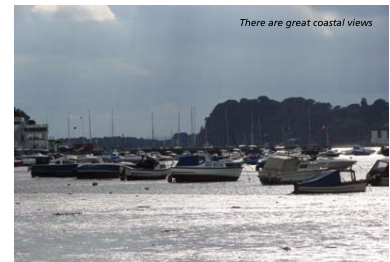
There are great coastal views